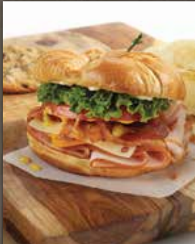
Turkey Club Croissant

Black Angus Club, Grilled Chicken Club, Turkey Club Croissant or Cobb Club • $9.00 per person