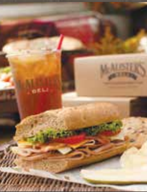
Traditional Box Lunch

Choose from one of our signature wraps: Chicken Caesar, Turkey Bacon Ranch, Veggie or Southwest Chicken • $9.00 per person