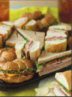
— Traditional Sandwich Tray —

We offer a variety of our premium, delicious sandwiches on our trays that will be sure to please any crowd.