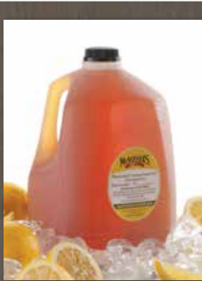
— Gallon of McAlister's Famous Sweet Tea™ —