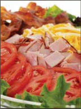
— Chef Salad —