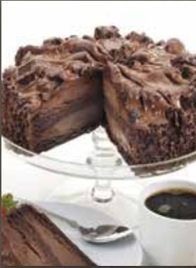
— Chocolate Lovin' Spooncake —

An assortment of cookies and brownies. Serves 12-14, 26 pieces • $22.00