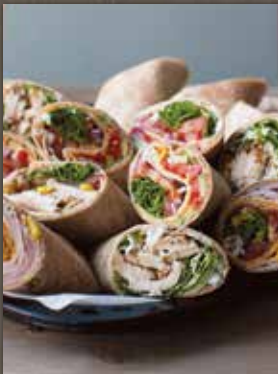
— Wrap Tray —