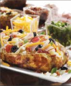
— Spud Max™ Bar —

We start with freshly baked, genuine Idaho potatoes and then let you create your own masterpiece with the most flavorful fillings that can be found around this great country. Fillings that will fill you up and leave you happy.