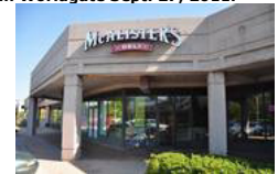
McAlister's Deli was opened Sept. 27, 2011 in Worldgate.